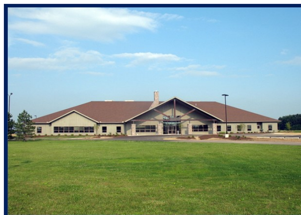
The Life Center Completed 2008 Funded by Gift From Anonymous Donor and Others