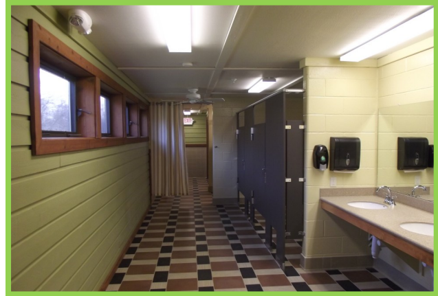
Jack W. Liebert Residence Hall B Completed 2012 Funded by an Anonymous Donor