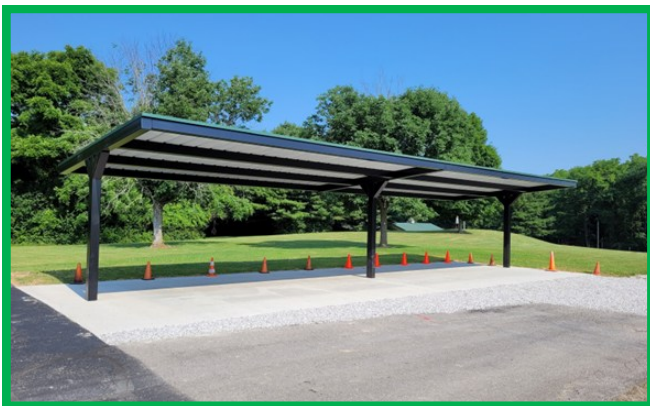
Golf Cart Shelter Completed 2025 Funded by the All Life Foundation