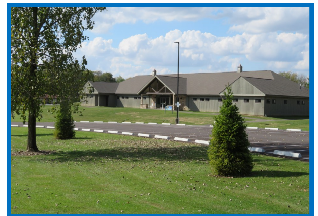
The Greif Retreat House Completed 2018 Major Funders Greif, Inc. & All Life Foundation