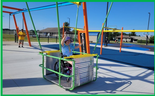
Universal and Accessible Track Ride Completed 2025 Funded by the All Life Foundation, Worthington Companies Foundation and The Columbus Foundation