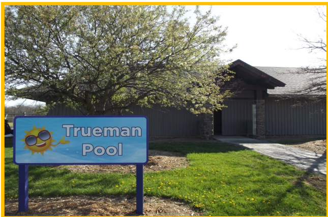
Trueman Pool House Renovation & Addition—Completed 2016 Major Funders Muirfield Invitational Golf, All Life Foundation & Anonymous