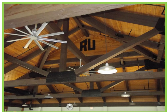
Thomas Dining Hall Completed 2014 Funded by the All Life Foundation