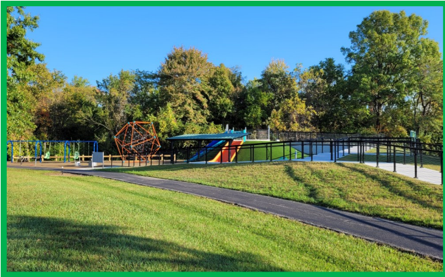
Complete Play Experience For All—A Signature Program Completed 2023 Funded by the All Life Foundation