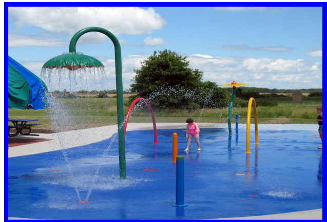
Aquatic Playground Completed 2010 Funded by an Anonymous Donor & Huntington Bank