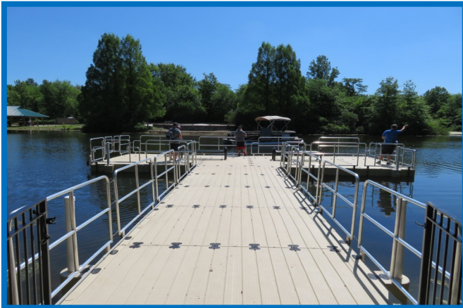
Boat Dock Renovation Completed 2020 Funded by the All Life Foundation