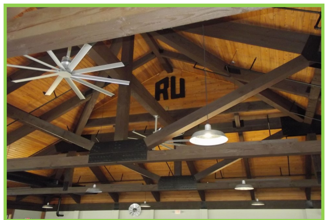
Thomas Dining Hall Completed 2014 Funded by the All Life Foundation