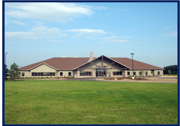
The Life Center Completed 2008 Funded by Gift From Anonymous Donor and Others