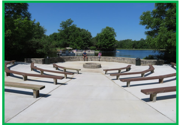
Amphitheater Renovation Completed 2020 Funded by the All Life Foundation