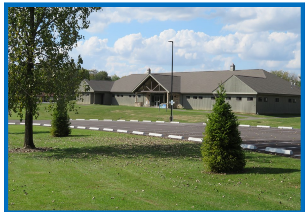
The Greif Retreat House Completed 2018 Major Funders Greif, Inc. & All Life Foundation