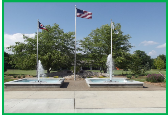
The Dempsey Family Welcome Center Fountains & Gardens Completed 2013 Funded by the All Life Foundation