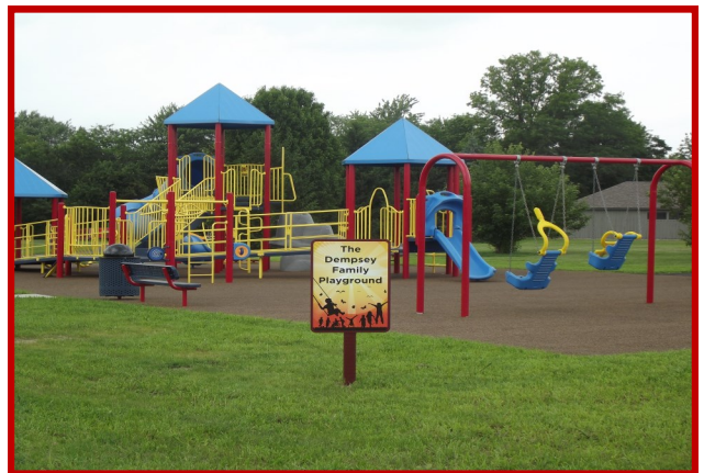
The Dempsey Family Accessible & Universal Playground Completed 2015 Funded by the All Life Foundation (Primary)