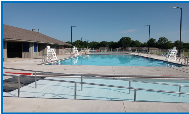
The Trueman Pool Renovation Completed 2022 Funded by the All Life Foundation