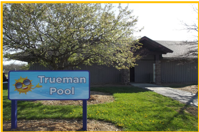
Trueman Pool House Renovation & Addition—Completed 2016 Major Funders Muirfield Invitational Golf, All Life Foundation & Anonymous