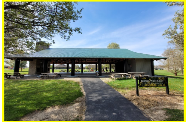
The Ingram-White Castle Pavilion Completed 2023 Funded by the All Life Foundation