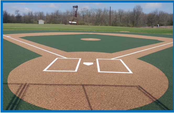
The Naomi Dempsey Field Completed 2020 Funded by the All Life Foundation