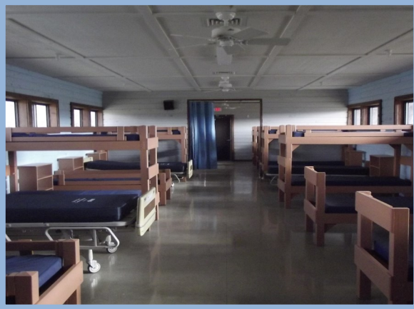
Muirfield Invitational Residence Hall C Completed 2014 Funded by Muirfield Invitational Golf