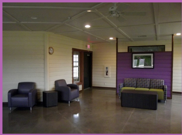
The Dempsey Family Residence Hall A Completed 2013 Funded by the All Life Foundation