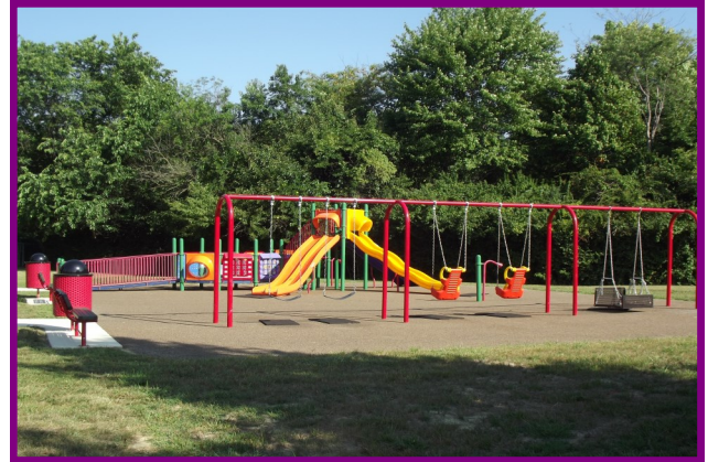
Pavilion Playground Renovation Completed 2016 Funded by the All Life Foundation