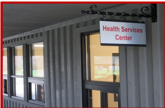
Health Services Center Renovation Completed 2019 Funded by an Anonymous Donor